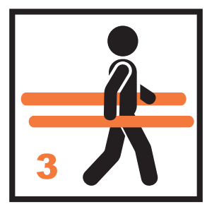
PARALLEL BARS Use for stability and safety of your patients who are regaining mobility